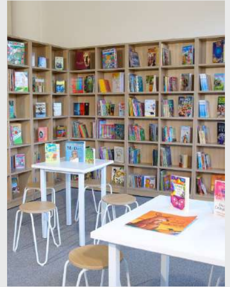
Our well stocked library.

We are certain that with the development of our learners' reading skills, their aptitude to effectively communicate and their overall ability to interact with others will certainly develop. Reading is to the mind what exercise is to the body! Here's to more Reading!