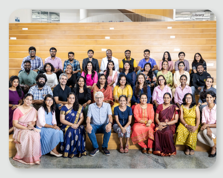
Teachers at Chaman Bhartiya School

Our learners celebrated Teacher's Day and Hindi Diwas with great zeal and vigour. The enthusiastic learners put together some wonderful performances like dance & music, and conducted fun games for their dear facilitators for Teachers Day. Our learners were thrilled to showcase their gratitude towards their facilitators. They engaged and connected with their teachers on this special occasion. Students also participated in Hindi Diwas - a celebration of the Hindi language. Learners performed various art forms including dance, singing and theatre to honour Hindi as an international language, and to celebrate its literary and cultural impact across the globe.